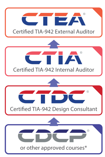
*Contact your local partner to check on approved courses